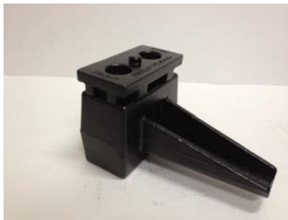
1.0" REAR LIFT OPTION

Step 9: Determine whether you want a 1.0", 1.5" or 2.0" rear lift, and orient the components according to the images shown below to achieve your desired ride height.