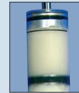
Non-pressurized shock, foaming