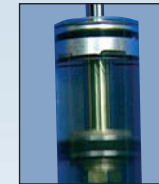
Gas pressure shock, no foaming